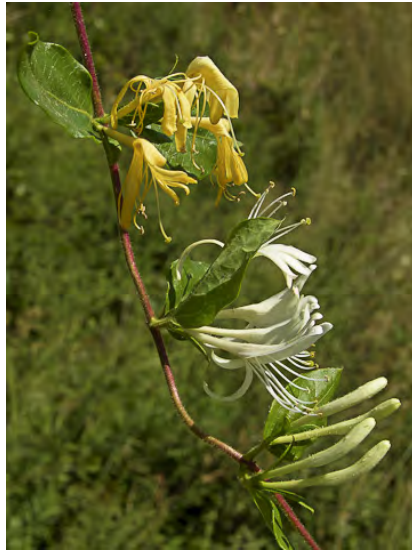
JAPANESE HONEYSUCKLE ( Lonicera japonica ) Naturalized Perennial - Honeysuckle Family - (May-Jul) - Disturbed places - Twining shrub. Leaf gen 1.2-3.1" long. Flowers white turning yellow, 1-1.6" long, in pairs. Fruits black. INVASIVE watch list.