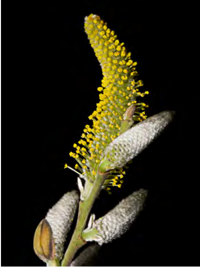
ARROYO WILLOW ( Salix lasiolepis ) Native Perennial - Willow Family - (Jan-Jun) - Common. Shores, marshes, meadows, etc - Shrub-tree, bark smooth. Leaf-like stipules. Leaf egg-shaped, waxy below. Fruit smooth, bract persistent, dark, stamens 2.