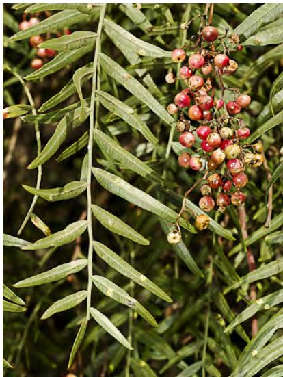
PEPPER TREE ( Schinus molle ) Naturalized Perennial - Sumac Family - (Jun-Aug) - Washes, slopes, abandoned fields - Tree 16-60' tall. Flowers white to yellow. Leaves compound, leaflets stemless. Fruits pink to red, 0.2-0.3" diam.