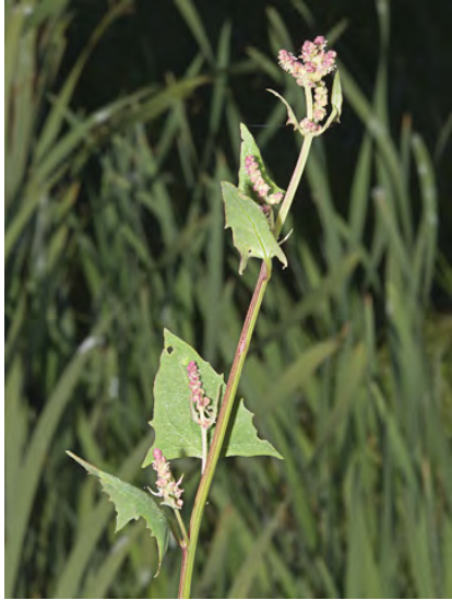
FAT-HEN ( Atriplex prostrata ) Native Annual - Goosefoot Family - (Apr–Oct) - Wet places, marshes - Plant 4-48" tall, branched at base. Leaves alternate, blades 0.4-3.5" long, triangular, green, not dense-scaly underneath.