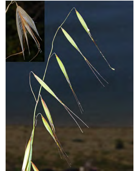
SLENDER WILD OAT ( Avena barbata ) Naturalized Annual - Grass Family - (Mar–Jun) - Disturbed sites - Plants gen 24-32". Spikelets 0.8-1.2" long. Awns 0.8-1.8" long. Lemma tip bristles >= 0.1" long. Seeds EDIBLE whole or ground for flour. INVASIVE weed.