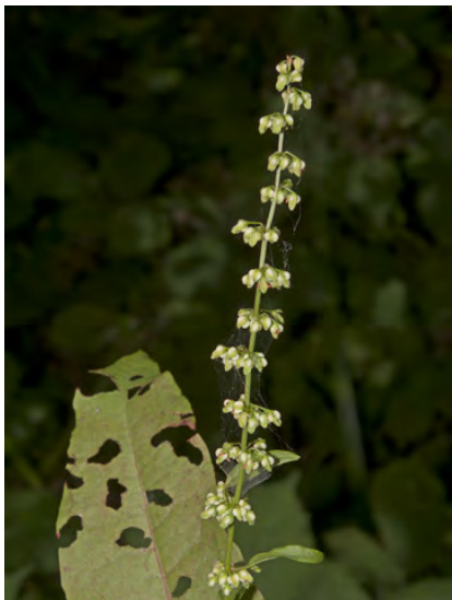
GREEN DOCK ( Rumex conglomeratus ) Naturalized Perennial - Buckwheat Family - (May–Aug) - Common. Moist places - Stem 12-32" tall, unbranched below. Flower cluster open. Fruit valves ~0.1" long, scarcely winged around the 3 tubercles, smooth edged.