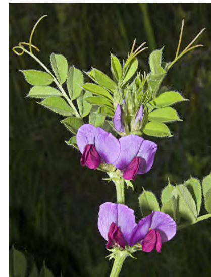
SPRING VETCH ( Vicia sativa subsp. sativa ) Naturalized Annual - Pea Family - (Mar-Jun) - Roadsides, disturbed areas, grassland, open areas in oak and riparian woodlands - Flowers 1-2 at leaf bases, pink-purple to white, 0.7-1.2" long. Leaflets 0.16-0.4" wide.