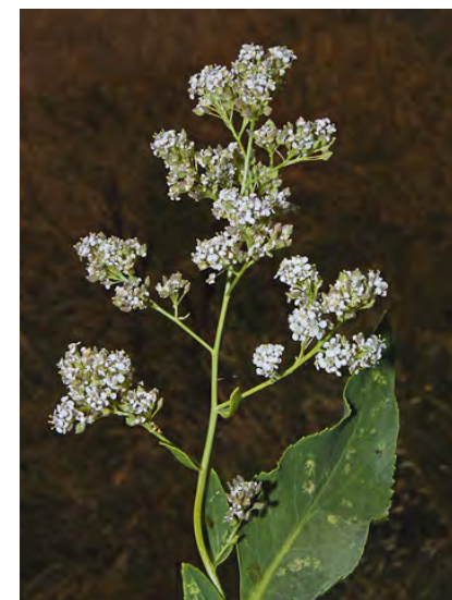
PERENNIAL PEPPERGRASS ( Lepidium latifolium ) Naturalized Perennial - Mustard Family - (Jun–Sep) - Pastures, disturbed areas, fields, grassland, saline meadows, streambanks, sagebrush scrub, edge of marshes - Plant 14-47". Petals white. NOXIOUS.