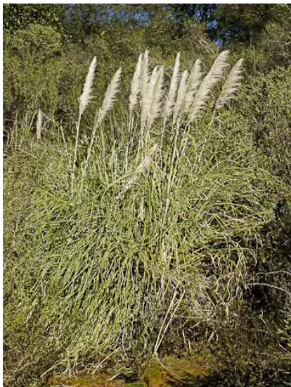
HAIRY PAMPAS GRASS ( Cortaderia jubata ) Naturalized Perennial - Grass Family - (Sep-Feb) - Disturbed sites, many habitats, esp coastal - Plant 6-23' tall. Leaf blades 0.1-0.5" wide, sheathes hairy. NOXIOUS weed.