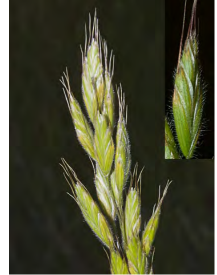
SOFT CHESS ( Bromus hordeaceus ) Naturalized Annual - Grass Family - (Apr-Jul) - Fields, disturbed areas - Plant 4-26" tall. Leaf hairy. Flower cluster 1-5" long, dense, some stalks > spikelet. Spikelet 0.5-0.9". Lemma 0.26-0.4", awn 0.16-0.4". INVASIVE weed.