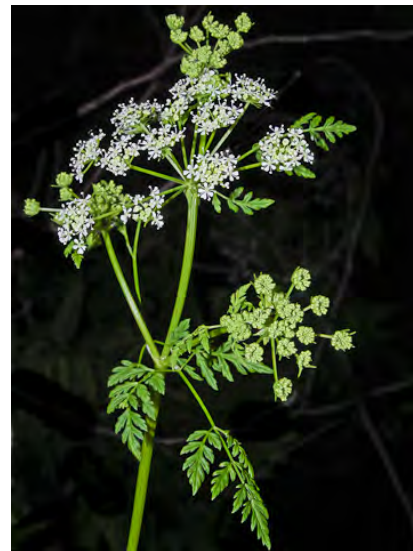
POISON HEMLOCK ( Conium maculatum ) Naturalized Biennial - Carrot Family - (Apr-Jul) - Common. Moist, esp disturbed places - Plants 2-10' tall. Stems purple-spotted. Leaves fern-like, gen 2x divided. Flowers white. TOXIC. INVASIVE weed.