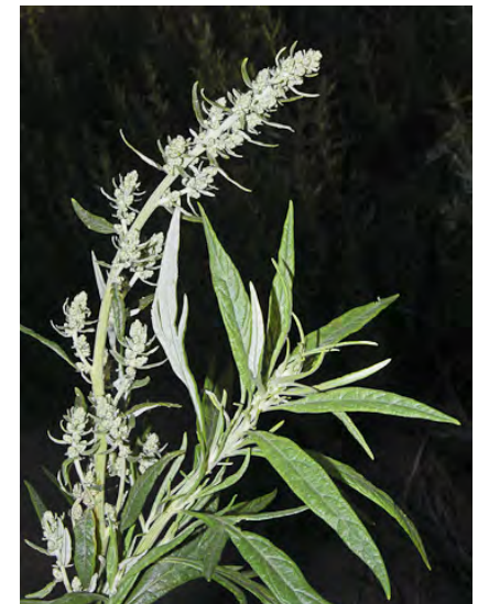
MUGWORT ( Artemisia douglasiana ) Native Perennial - Sunflower Family - (May–Nov) - Common. Open to shady areas, often in drainages - Plant 20-60" tall. Leaves gen 0.4-4" long, densely hairy below, some 3-5 lobed. Flower bracts hairy.