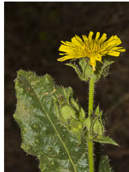
BRISTLY OX-TONGUE ( Helminthotheca echioides ) Naturalized Annual-Biennial - Sunflower Family - (All year) - Common. Disturbed areas - Stem 1-6.5' tall, bristly. Leaf 2-8" long, covered with prickly bumps. Flower heads 0.8-1.6" wide. INVASIVE weed.