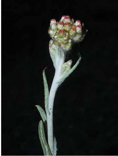
WEEDY CUDWEED ( Pseudognaphalium luteoalbum ) Naturalized Annual - Sunflower Family - (Apr–Aug) - Disturbed sites, fields, streambeds - Heads 0.12-0.16" long, yellowish, female flowers < 0.08" long, pappus bristles connected.