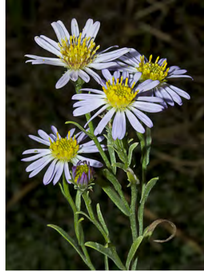
SUISUN MARSH ASTER ( Symphyotrichum lentum ) Native Perennial - Sunflower Family - (May–Nov) - Marshes - Stem 16-47" tall, not hairy. Leaves 1.6-3.1" long, 0.2-0.3" wide. Flower cluster openly branched. Ray flowers violet, 20-45, 0.31-0.55" long.