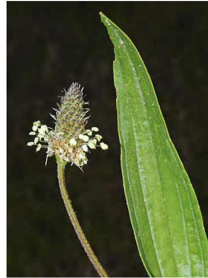
ENGLISH PLANTAIN ( Plantago lanceolata ) Naturalized Annual - Plantain Family - (Apr–Aug) - Common. Disturbed areas - Leaves basal, hairy, 2-10" long, <= 1" wide. Flowers + stem 8-31" tall, flower cluster 0.8-3" long. INVASIVE , lawn weed.