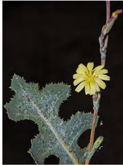
PRICKLY LETTUCE ( Lactuca serriola ) Naturalized Annual - Sunflower Family - (May–Oct) - Abundant. Disturbed places - Stem 1.6-10' tall, prickly-bristly. Leaves deeply-lobed, midvein and edges prickly-bristly. Flowers pale yellow, 0.16-0.2" wide.