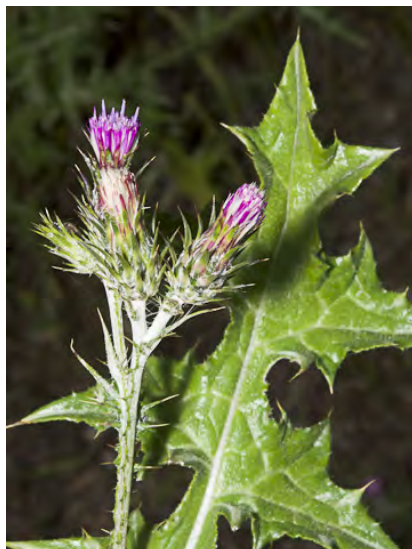
ITALIAN THISTLE ( Carduus pycnocephalus subsp. pycnocephalus ) Naturalized Annual - Sunflower Family - (Mar-Jul) - Roadsides, pastures, disturbed areas - Stems 8-79", narrow spiny-wings. Lower leaves 4-10 lobed, heads 2-5, flower bracts woolly. NOXIOUS.