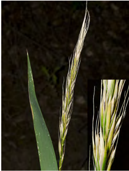
BEARDLESS WILD RYE ( Elymus triticoides ) Native Perennial - Grass Family - (Jun-Jul) - Dry to moist, often saline, meadows - Plant 18-50" tall, from rhizomes. Flower cluster 2-8" long. Spikelets generally 2/node. Lemmas 3-7, 0.2-0.5" long, awn to 0.12" long.