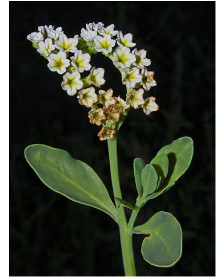
SEASIDE HELIOTROPE ( Heliotropium curassavicum var. oculatum ) Native Perennial - Borage Family - (Feb-Oct) - Moist to dry, saline to alkaline soils, gen near water - Plant fleshy. Leaf 0.4-2.4 cm long. Flowers white w/ yellow center, 0.12-0.2" long.