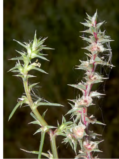
RUSSIAN THISTLE ( Salsola tragus ) Naturalized Annual-Perennial - Goosefoot Family - (Jul–Oct) - Common. Disturbed places - Plant < 5' tall. Stem gen red-striped, widely branched. Leaves succulent, 0.3-2" long, upper spine-tipped. NOXIOUS.