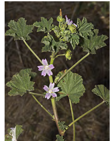
BULL MALLOW ( Malva nicaeensis ) Naturalized Annual - Mallow Family - (Mar-Jun) - Disturbed places - Stem 0.7-2'. Leaf blade 1.2-4.7" wide, 5-7 shallow lobes. Bractlets egg-shaped, 0.16-0.2" long. Petals pink to blue-violet, 0.2-0.5" long.