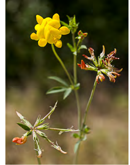
BIRD'S-FOOT TREFOIL ( Lotus corniculatus ) Naturalized Perennial - Pea Family - (Jun-Sep) - Open, disturbed areas - Leaflets 5, 0.16-0.9" long. Flower cluster 3-7 flowered on 0.6-4.7" stalk. Flowers bright yellow, 0.4-0.55" long, banner often reddish.