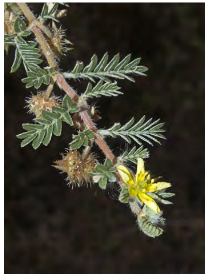
PUNCTURE VINE ( Tribulus terrestris ) Naturalized Annual - Caltrop Family - (Apr–Oct) - Dry, disturbed areas incl roadsides, railways, vacant lots - Sprawling. Leaflets 6-12. Flowers yellow, < 0.2" wide. Fruits star-like, spines 0.16-0.28" long. NOXIOUS .