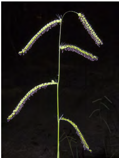
DALLIS GRASS ( Paspalum dilatatum ) Naturalized Perennial - Grass Family - (May-Nov) - Disturbed areas - Tufted, weedy. Stem 1.6-5.7' tall. Leaves to 14" long. Flowering stem w/3-6 branches. Spikelet groups 2-7, each 0.6-4.7" long. Spikelets ~0.14", paired.