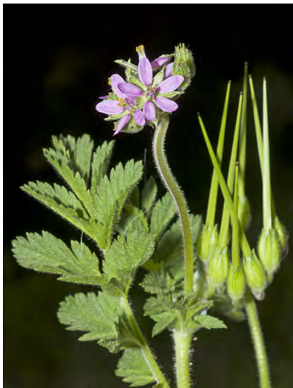
GREENSTEM FILAREE ( Erodium moschatum ) Naturalized Annual - Geranium Family - (Feb-Sep) - Open, disturbed sites - Stem 4-24", short-hairy. Leaves compound, leaflets toothed. Sepal tip glabrous. Petals 0.4-0.6" long, pink. Fruit beak 0.8-1.6" long.