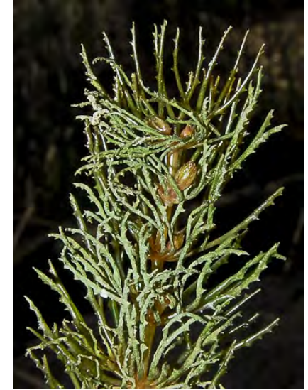
HORNWORT ( Ceratophyllum demersum ) Native Annual - Hornwort Family - (Jun–Aug) - Common. Ditches, lakes, ponds, pools, slow watercourses; water 0.1–4 m deep, fresh to ± brackish, medium to high nutrient levels. - Leaves forked, serrate, stiff.