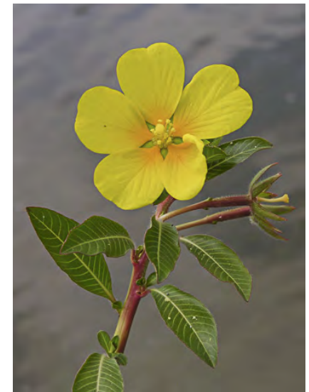
YELLOW WATER PRIMROSE ( Ludwigia peploides subsp. peploides ) Native Perennial - Evening Primrose Family - (May–Oct) - Lakeshores, streambanks, seasonal wetlands - Aquatic w/floating-creeping stems. Leaves alternate. Sepals 0.25-0.4", petals 0.35-0.5".