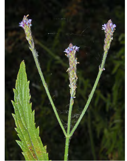
TALL VERVAIN ( Verbena bonariensis ) Naturalized Annual-Biennial - Vervain Family - (Jun–Oct) - Disturbed, often wet places, fields - Plant 20-60". Leaf 3-6" long, gen clasping stem. Flowers white or purple, 0.2-0.24" long; 8-17/cluster.