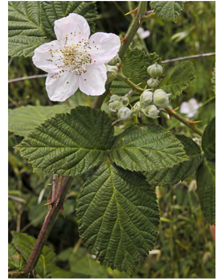
HIMALAYAN BLACKBERRY ( Rubus armeniacus ) Naturalized Perennial - Rose Family - (Mar-Jun) - Common. Disturbed areas, roadsides - Shrub w/thorny 5-angled stem. Leaflets 3-5, white-hairy beneath. Blackberry-type fruit. INVASIVE.