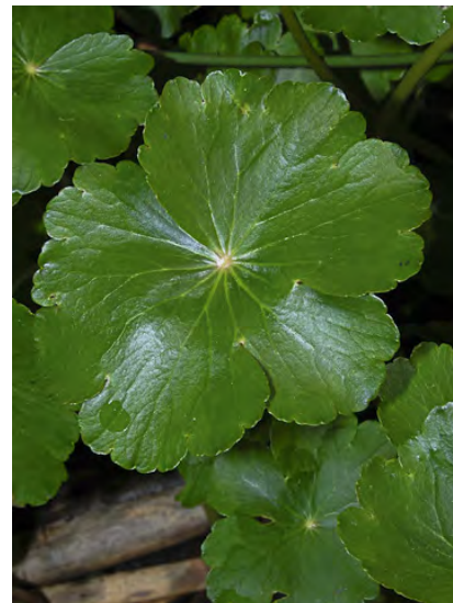
FLOATING MARSH PENNYWORT ( Hydrocotyle ranunculoides ) Native Perennial - Ginseng Family - (Mar–Aug) - Lake margins, ponds, slow-moving streams - Plant fleshy, floating-creeping. Leaf 0.8-2" wide, kidney-shaped, deep lobes, 1 reaching center.