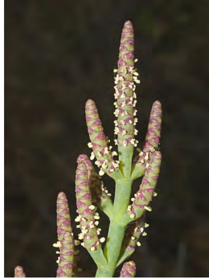
PACIFIC PICKLEWEED ( Salicornia pacifica ) Native Perennial - Goosefoot Family - (Jul–Nov) - Salt marshes, alkaline flats - Plant 4-28" tall, branching from base, branches opposite. Flower clusters 0.8-3.3" long, 0.1-0.2" wide.