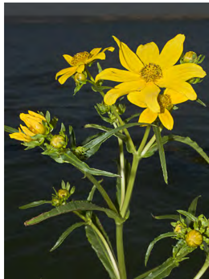
BUR-MARIGOLD ( Bidens laevis ) Native Annual-Perennial - Sunflower Family - (Aug-Nov) - Freshwater wetlands - Plant 8"-8' tall, with round stem. Leaves w/o stalks, simple, 2-6" long, serrate edges. Flowers showy, yellow; rays 7-8, 0.6-1.2" long.