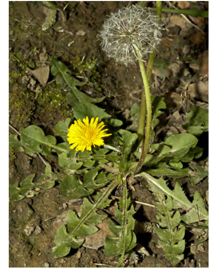
COMMON DANDELION ( Taraxacum officinale ) Naturalized Biennial-Perennial - Sunflower Family - (All year) - Abundant. Esp disturbed areas - Stem hollow. Leaves bright green with sharp down-pointing lobes. Outer head bracts reflexed. Fruit ~ brown.