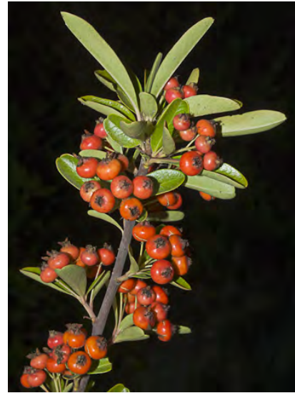
WOOLLY FIRETHORN ( Pyracantha angustifolia ) Naturalized Perennial - Rose Family - (Feb-Jun) - Disturbed areas, fencerows, abandoned fields, roadsides - Plant < 13', gray-hairy. Leaves narrow, entire. Calyx and below leaves often woolly. INVASIVE.