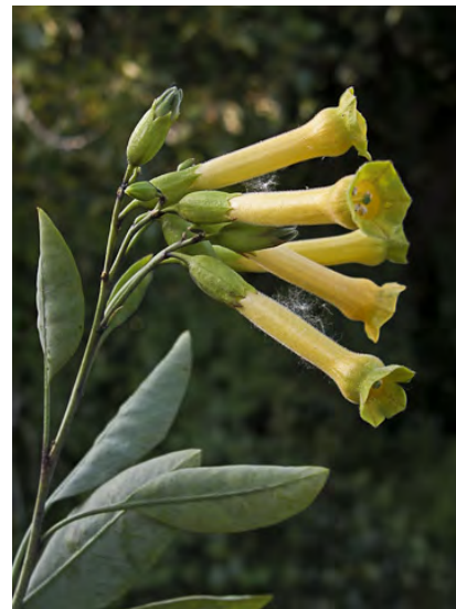
TREE TOBACCO ( Nicotiana glauca ) Naturalized Perennial - Nightshade Family - (Apr-Aug) - Open, disturbed flats or slopes - Shrub or small tree, waxy-blue. Leaves 2-8" long. Flowers yellow, 1.2-1.4" long. INVASIVE. TOXIC to livestock.