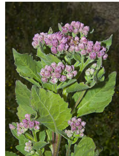
SALTMARSH-FLEABANE ( Pluchea odorata var. odorata ) Native Perennial - Sunflower Family - (Jun-Nov) - Moist, often saline valley bottoms - Plant 20-48"+, sticky. Leaves 1.6-4.7" long, egg-shaped. Flowers purple, ~0.2" long, in leaf axis.