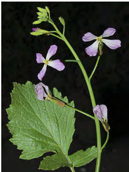
RADISH ( Raphanus sativus ) Naturalized Annual - Mustard Family - (May-Jul) - Disturbed areas, fields - Stem 16-51" long. Petals 0.6-1" long, white to purple. Fruit a fat cylinder w/constrictions between seeds. INVASIVE weed.