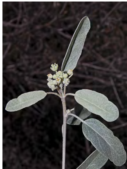
CROTON ( Croton californicus ) Native Perennial - Spurge Family - (Apr–Jul) - Sandy soils, dunes, washes - Plant < 39" tall, covered with short, matted hairs. 1 sex/plant. Leaf blades 0.8-2.2" long, gray underneath.