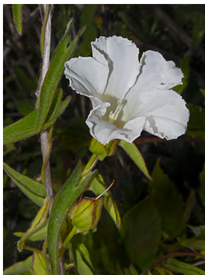
HEDGE BINDWEED ( Calystegia sepium subsp. limnophila ) Native Perennial - Morning-glory Family - (May–Jul) - Marshes, riverbanks - Stem climbing, < 13', smooth (hairy). Flower 1.2-2.4" long, white to pink-tinged. Bractlets concealing flower bracts.