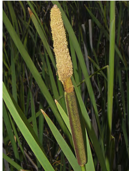
BROAD-LEAVED CATTAIL ( Typha latifolia ) Native Perennial - Cattail Family - (Jun–Jul) - Unpolluted to nutrient-rich freshwater (brackish) marshes - Plant 4.9-9.8' tall. Widest leaves 0.4-1.1" wide. Flower cluster with no gap between flower types.