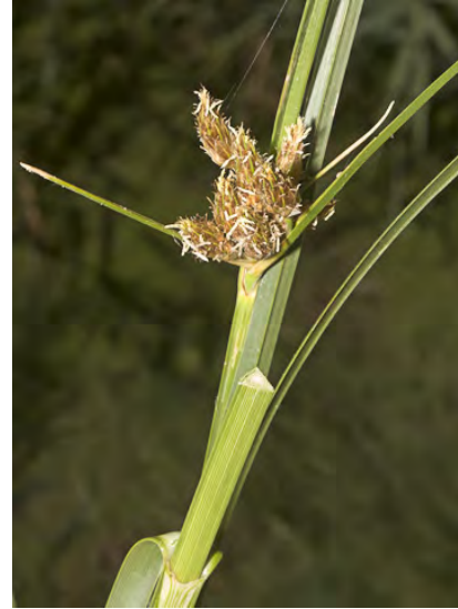
SEACOAST BULRUSH ( Bolboschoenus robustus ) Native Perennial - Sedge Family - (Summer) - Brackish to saline coastal marshes - Plant 20–60" tall. Stem sharply triangular. Flower cluster dense, stemless, just above bracts. Spikelets 5–25, 0.4–1.2" long.