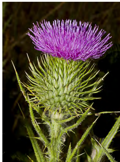
BULL THISTLE ( Cirsium vulgare ) Naturalized Biennial - Sunflower Family - (May-Oct) - Common. Disturbed areas - Plant 12-79" tall. Top of leaves bristly; leaf base forming decurrent wings on stem. Flowers purple, gen 1-2" wide. NOXIOUS weed.