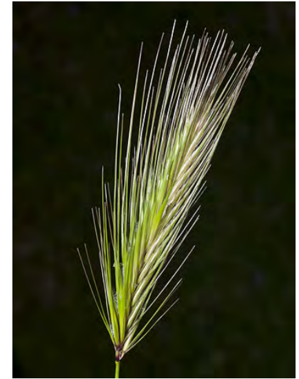
WALL BARLEY ( Hordeum murinum subsp. murinum ) Naturalized Annual - Grass Family - (Feb-May) - Moist, gen disturbed sites - Stem 1-2'. Leaf auricles notable. Central spikelet stalk 0-0.02". Central floret gen = lateral florets. INVASIVE weed.