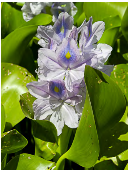
WATER HYACINTH ( Eichhornia crassipes ) Naturalized Perennial - Pickerel-weed Family - (Jun-Oct) - Locally abundant. Ponds, sloughs, waterways - Aquatic. Leaf < 4" wide, inflated leaf stalk base. Flower lilac or pale blue to white. NOXIOUS.