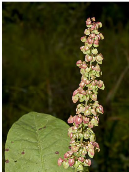
CURLY DOCK ( Rumex crispus ) Naturalized Perennial - Buckwheat Family - (All year) - Abundant. Disturbed places - Stem 16-39" tall. Flower cluster dense, valves 0.2-0.24", winged around tubercles, smooth edged. 1 tubercle enlarged. INVASIVE .