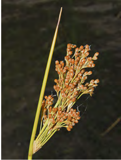
BALTIC RUSH ( Juncus balticus subsp. ater ) Native Perennial - Rush Family - (Jul–Nov) - Moist to ± dry sites - Stem 14–43" tall, round, not twisted. No leaf blade. Flowers generally 0.1–0.2" long.