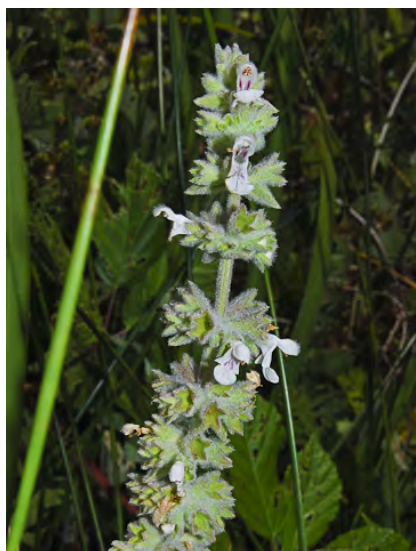
WHITE-STEM HEDGE-NETTLE ( Stachys albens ) Native Perennial - Mint Family - (May–Oct) - Swamps, seeps - Plant 1.6-8' tall, densely cobwebby-hairy. Leaf felty, blade 1.2-6" long. Flowers white to pink; tube 0.2-0.4" long, hidden in bracts.