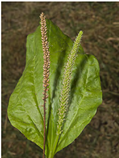
COMMON PLANTAIN ( Plantago major ) Naturalized Annual-Perennial - Plantain Family - (Apr–Sep) - Disturbed areas - Leaves basal, blades 5-18 cm long, broadly oval, not hairy. Flowers + stem 2-24" tall, flower cluster gen 1.2-8" long.