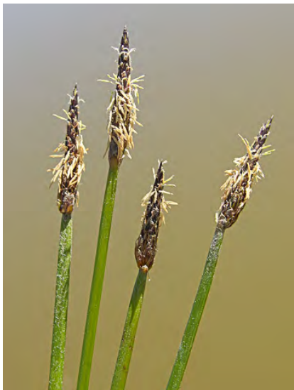
COMMON SPIKERUSH ( Eleocharis macrostachya ) Native Perennial - Sedge Family - (Spring–summer) - Common. Fresh to brackish wetland - Stem 8–39" tall, 0.06–0.1" wide. Spikelet 0.2–1.6" long, 0.08–0.2" wide, style 2-branched.