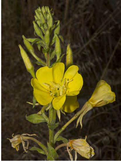
HOOKER EVENING-PRIMROSE ( Oenothera elata subsp. hookeri ) Native Biennial - Evening Primrose Family - (Jun-Sep) - Moist, coastal, slightly inland, sandy bluffs - Plant 16-32", sticky-hairy. Leaves 1.6-10" long, flat. Petals yellow, 1-2" long. Seeds all fertile.