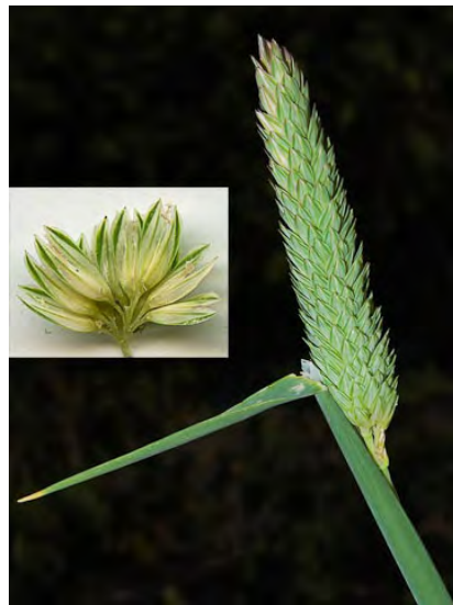
HARDING GRASS ( Phalaris aquatica ) Naturalized Perennial - Grass Family - (Apr-Aug) - Disturbed areas, roadsides - Plant 16-79" tall, tufted. Flower cluster 0.6-6" long, unbranched. Lower florets 1 or or unequal. Glume wing untoothed. INVASIVE weed.