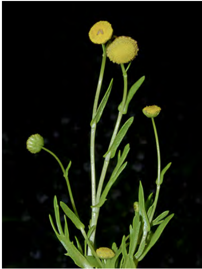
BRASS-BUTTONS ( Cotula coronopifolia ) Naturalized Perennial - Sunflower Family - (Mar-Dec) - Common. Saline and freshwater marshes, mud flats - Plant 2-16"+ tall, smooth, ± fleshy. Leaves linear to lance-shaped w/linear teeth or lobes. INVASIVE.