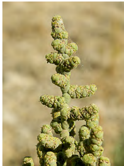
IODINE BUSH ( Allenrolfea occidentalis ) Native Perennial - Goosefoot Family - (Jun–Aug) - Flats, hummocks, in alkaline soils - Succulent shrub 1-5' tall. Jointed stem, each green joint 0.1-0.4" long by 0.1-0.2" wide. Leaves alternate, scale-like, 0.1-0.2" long.