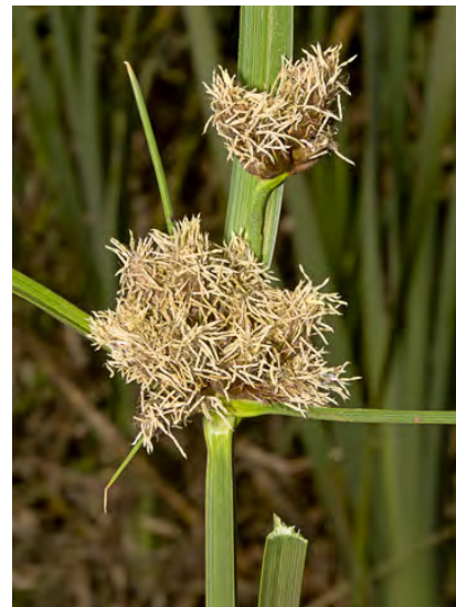
OLNEY'S THREE-SQUARE BULRUSH ( Schoenoplectus americanus ) Native Perennial - Sedge Family - (Summer) - Mineral-rich or brackish marshes, shores, fens, springs - Stem 1.2–8.2' tall, sharply 3-angled, not leafy. Flower cluster head-like.