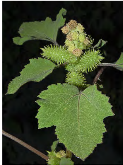
COCKLEBUR ( Xanthium strumarium ) Native Annual - Sunflower Family - (Jul-Oct) - Disturbed, seasonally wet, often alkaline sites, in grassland, marshes, watercourses - Plant 4-32" tall. Stem spineless. Bur 0.4-1.2"+ long.