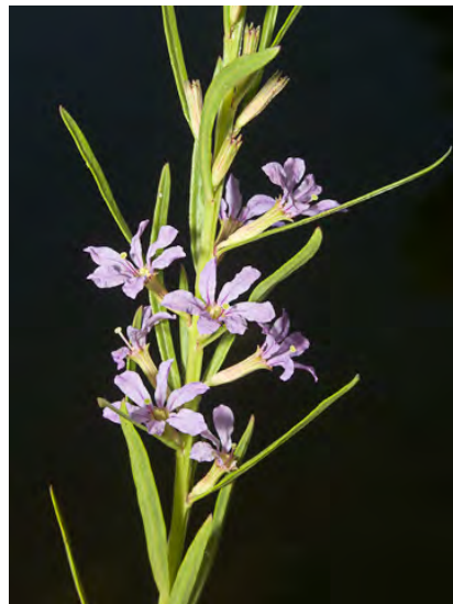
CALIFORNIA LOOSESTRIFE ( Lythrum californicum ) Native Perennial - Loosestrife Family - (Apr-Sep) - Marshes, pond and stream margins - Stem 8-24" tall. Leaves 0.4-2.8" long, gray-smooth, linear. Petals purple, 0.2-0.3" long; 2 style forms.