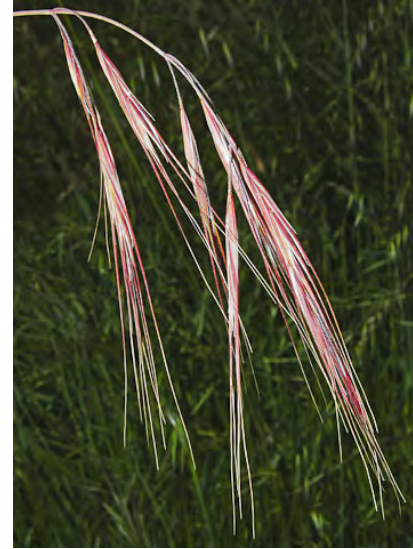
RIPGUT GRASS ( Bromus diandrus ) Naturalized Annual - Grass Family - (Apr-Jul) - Open, gen disturbed areas - Plant 6-40" tall. Spikelet 1-2.8" long. Lemma body 0.8-1.2" long, awn > 1.2" long. Barbed seeds can stick in flesh of animals. INVASIVE weed.