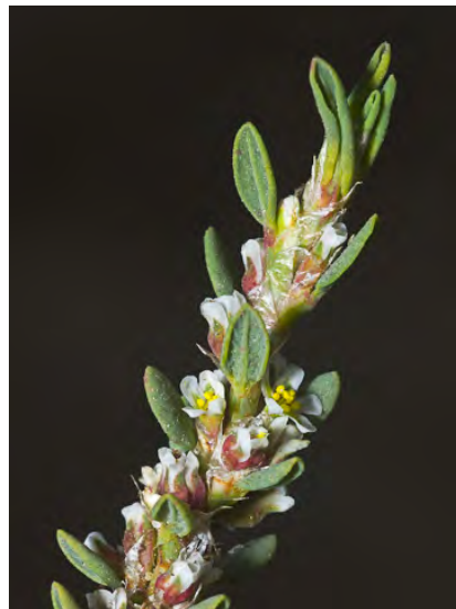
KNOTWEED ( Polygonum aviculare subsp. depressum ) Naturalized Annual - Buckwheat Family - (May-Nov) - Disturbed places - Stem 4-20", mat-forming. Flowers 2-8/leaf axil, ~0.1" long, fused 1/2 length, w/white or pink margins.