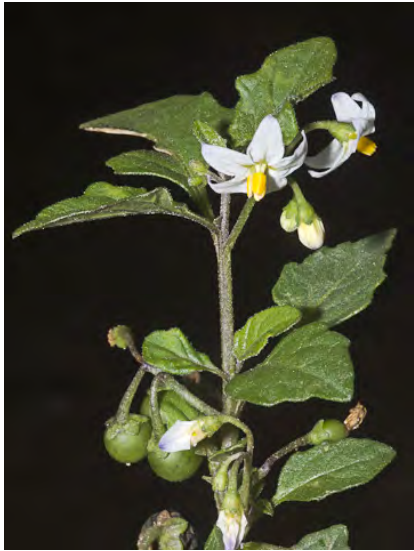
BLACK NIGHTSHADE ( Solanum nigrum ) Naturalized Annual - Nightshade Family - (Mar–Oct) - Disturbed places - Flower 0.4" wide w/deep lobes, white. Anthers 0.08" long. Seeds 0.08". Bracts 0.08-0.12" long, not curled back in fruit.