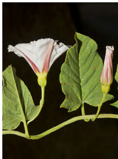
BINDWEED ( Convolvulus arvensis ) Naturalized Perennial - Morning-glory Family - (Mar–Oct) - Roadsides, open areas in many pl communities - Trailing. Leaf 0.8-1.2" long, w/round tip, pointed lobes. Flowers white to pink, 0.8-1" long. NOXIOUS.