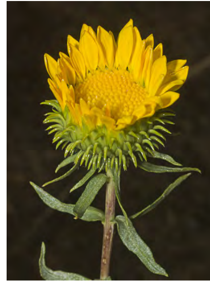
GREAT VALLEY GUMPLANT ( Grindelia camporum ) Native Perennial - Sunflower Family - (May-Nov) - Sandy or saline bottomland, roadsides - Stem non-woody, 2-8' tall, whitish. Leaves gen resinous. Head to 1.2" wide, bracts bend downward.