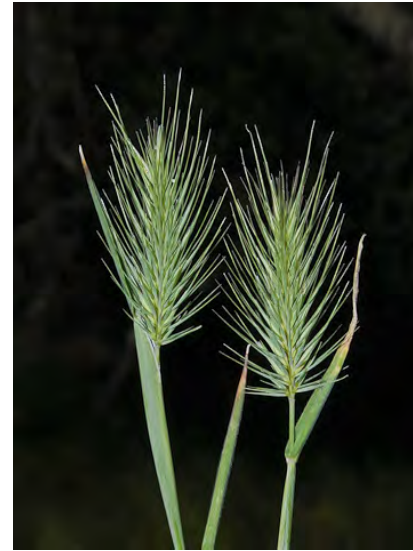
MEDITERRANEAN BARLEY ( Hordeum marinum subsp. gussoneanum ) Naturalized Annual - Grass Family - (Apr-Jun) - Dry to moist, disturbed sites - Stem 4-20". Leaf blades to 32" long, auricles < 0.08". Central lemma awn 0.25-0.7" long. INVASIVE weed.