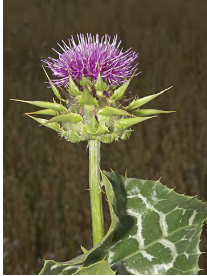
MILK THISTLE ( Silybum marianum ) Naturalized Annual-Biennial - Sunflower Family - (Feb–Jun) - Roadsides, pastures, disturbed areas - Stem 1-10', stout. Leaves spiny, shiny green w/white veins and spots. Flowers red-purple. INVASIVE weed.