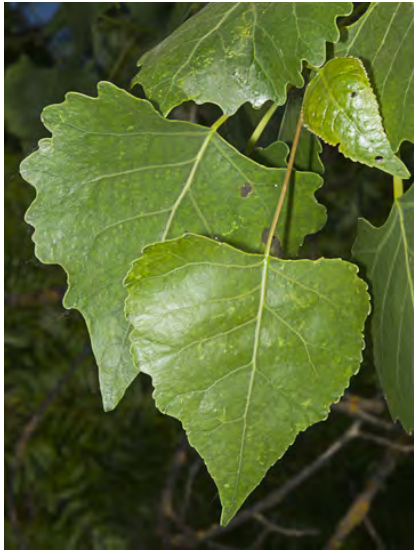
FREMONT COTTONWOOD ( Populus fremontii subsp. fremontii ) Native Perennial - Willow Family - (Mar-Apr) - Scattered. Alluvial bottomland, streambanks - Tree < 66' tall. Leaves heart-shaped to triangular, coarsely scalloped, blade 1.2-2.8" long.