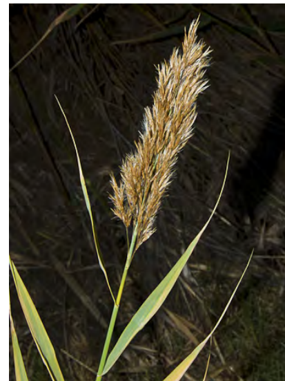
COMMON REED ( Phragmites australis ) Native Perennial - Grass Family - (Jul-Nov) - Pond & lake margins, sloughs, marshes - Stem 6.6-13', gen < 0.4" diam. Leaf blades gen 8-18" long, base gradually narrowed. Flower cluster 6-20". Spikelet 0.4-0.6", lemmas smooth.