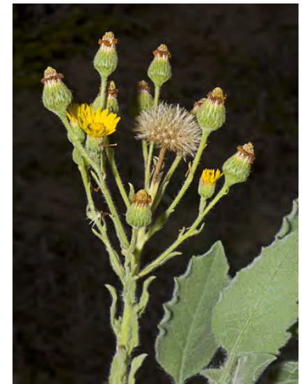
TELEGRAPH WEED ( Heterotheca grandiflora ) Native Annual - Sunflower Family - (Jun-Oct(± all year)) - Disturbed areas, dry streambeds, sand dunes - Plant 0.3-8' tall, bristly, sticky, branched above. Leaf 0.8-2.8" long, lower clasp stem. Rays 25-40, 0.2-0.3" long.