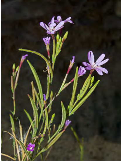
PANICLED / WEEDY WILLOWHERB ( Epilobium brachycarpum ) Native Annual - Evening Primrose Family - (Jun-Sep) - Common. Dry open or disturbed woodland, grassland, roadsides - Plant 8-79" tall, diffuse. Petals 2-15 mm long, white to rose-purple.