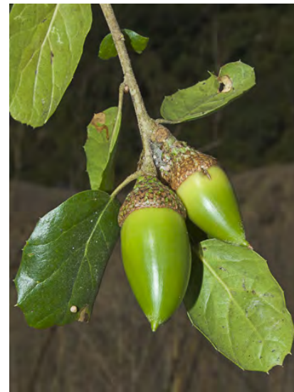
COAST LIVE OAK ( Quercus agrifolia var. agrifolia ) Native Perennial - Oak Family - (Mar–Apr) - Valleys, slopes, mixed-evergreen forest, woodland - Tree 30-80'. Leaves convex, hair-tuft below in vein axils. Acorns on 1st year twigs, shell glabrous inside.