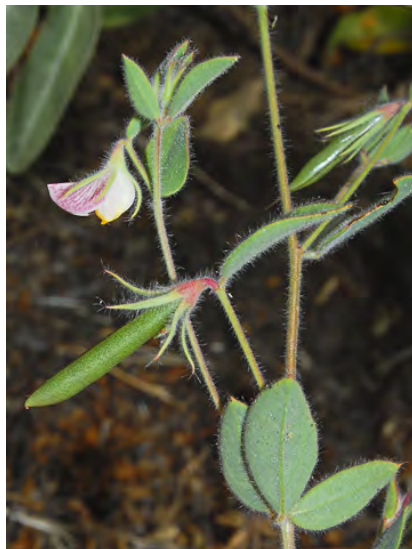
SPANISH CLOVER ( Acmispon americanus var. americanus ) Native Annual - Pea Family - (May-Oct) - Coast, chaparral, waterways, roadsides, disturbed areas - Plant 2-24", hairy. Flowers white to pink, solitary, bract lobes >> flower tube.