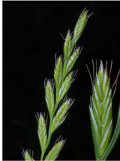
RYE GRASS ( Festuca perennis ) Naturalized Perennial - Grass Family - (May-Sep) - Dry to moist disturbed sites, abandoned fields - Stem 20-40" tall. Spikelet 0.2-0.9" long, > glume, awned or awnless. Sterile shoots at base. INVASIVE weed.