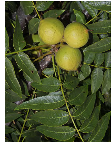
N. CALIFORNIA BLACK WALNUT ( Juglans hindsii ) Native Perennial - Walnut Family - (Apr–May) - Along streams, disturbed slopes - Tree 20-75'. Leaflets 13-21, 3-5". Fruit 1.4-2" wide. CNPS: SERIOUSLY ENDANGERED (unplanted).