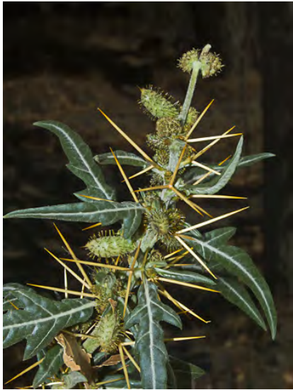
SPINY COCKLEBUR ( Xanthium spinosum ) Native Annual - Sunflower Family - (Jul-Oct) - Disturbed, seasonally wet, often alkaline sites, in grassland, marshes, watercourses - Plant 4-24". Stem node spines 0.6-1.2" long, golden, gen 3-lobed. Bur 0.4-0.5" long.