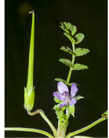
LONG-BEAKED FILAREE ( Erodium botrys ) Naturalized Annual - Geranium Family - (Mar-Jul) - Dry, open or disturbed sites - Stem 4-35" tall, coarse-hairy. Leaves lobed. Petals pink, 0.3-0.5" long. Sepals w/reddish tip. Fruit beak 2-4.7" long.