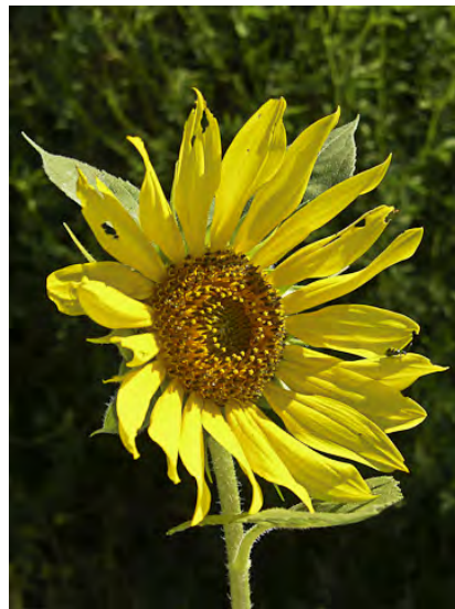
COMMON SUNFLOWER ( Helianthus annuus ) Native Perennial - Sunflower Family - (Jun-Oct) - Disturbed areas, scrub, grassland, many other habitats - Plant < 10'. Leaf blades 4-16" long, <= 2x width. Rays 0.2-2" long, disks reddish. Head bracts 0.2-0.3" wide.