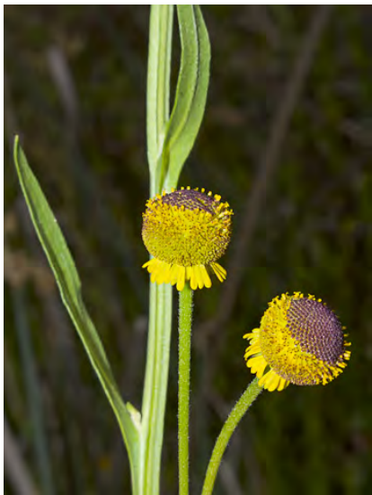
ROSILLA ( Helenium puberulum ) Native Biennial - Sunflower Family - (Jun-Aug) - Streambanks, seepage areas, lake margins - Plant 20-63". Flower head spherical, disk flowers ~0.1" long, yellow on sides, brown-purple on top; rays 0.15-0.4" long, point down.