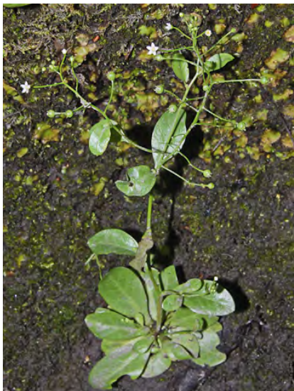
SEASIDE BROOKWEED ( Samolus parviflorus ) Native Perennial - Theophrasta Family - (Spring–summer) - Moist sites - Stem 6-16" long. Leaves 0.8-2" long, mostly basal, alternate on stem. Flowers white, 0.06" wide, at stem ends.