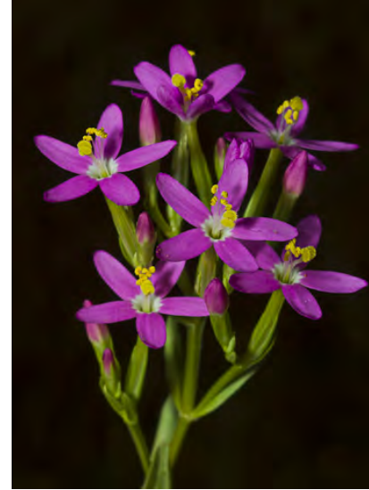
MONTEREY CENTAURY ( Zeltnera muehlenbergii ) Native Annual-Biennial - Gentian Family - (Jun-Aug) - Moist coastal bluffs, forest openings - Plant 1.2-12" tall. Leaf 0.6-1" long. Flowers pink, 0.5-0.75" mm long, lobes 0.08-0.28" long; flower stalk < 0.0" long.