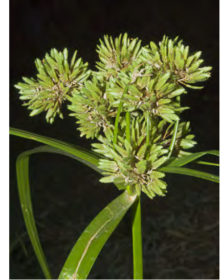
TALL NUTSEDEGE ( Cyperus eragrostis ) Native Perennial - Sedge Family - (May–Nov) - Vernal pools, streambanks - Leaves basal. Flower cluster bracts 4–8. Spikelets 0.2–0.8" long, oblong, in heads to 1.6" wide. Seeds short-stalked.