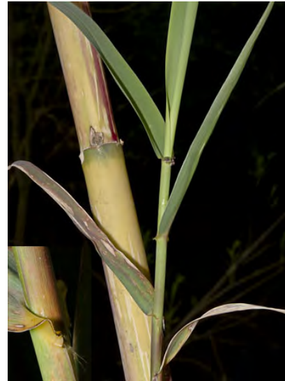
GIANT REED ( Arundo donax ) Naturalized Perennial - Grass Family - (Mar–Sep) - Moist places, seeps, ditchbanks - Stem 6-33' tall, matures woody. Leaves evenly spaced on stem. Flower cluster 8-28" tall, up to 5" wide. Spikelet ~0.5" long. NOXIOUS weed.