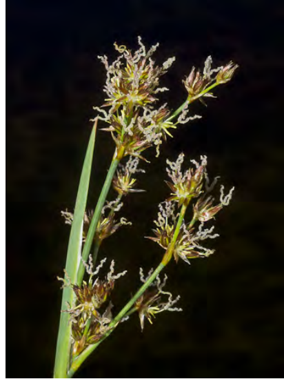
IRIS-LEAVED RUSH ( Juncus xiphioides ) Native Perennial - Rush Family - (Jul–Oct) - Wet places - Plant 16–32" tall. Leaf blades 0.2–0.5" wide, flat, iris-like. Heads many, few-flowered. Anthers 6, < filaments, flowers self-pollinating.