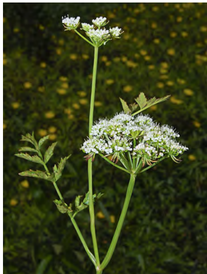
WATER PARSLEY ( Oenanthe sarmentosa ) Native Perennial - Carrot Family - (Jun–Oct) - Streams, marshes, ponds, gen aquatic - Plant 20-60" tall. Young shoots curled, tendril-like. Leaves twice-pinnate, leaflets alike, broad, serrate to lobed. Flowers white.