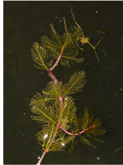
EURASIAN WATER-MILFOIL ( Myriophyllum spicatum ) Naturalized Perennial - Water-milfoil Family - (Jul-Sep) - Uncommon. Ditches, lake margins - Aquatic. Stem > 39" long. Leaf divisions > 28, paired, 0.4" long. Inflor leaves < 0.12" long. INVASIVE.