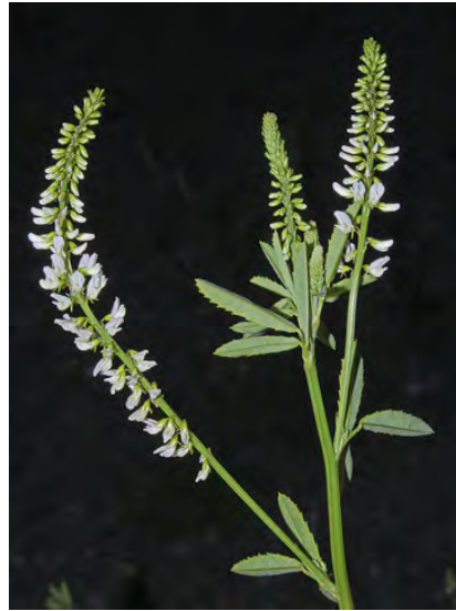
WHITE SWEETCLOVER ( Melilotus albus ) Naturalized Annual-Biennial - Pea Family - (May–Sep) - Locally abundant. Pastures, open disturbed sites - Stem 1.6-6.6' long. Leaflets 3, 0.4-1" long, toothed. Flowers white, 0.14-0.2" long.