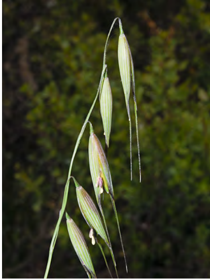
WILD OAT ( Avena fatua ) Naturalized Annual - Grass Family - (Apr-Jun) - Disturbed sites - Plants 1-5' tall. Spikelets 0.7-1.3" long. Low awn 1-1.6" long. Lemma tip bristles < 0.04" long. Seeds EDIBLE whole or ground for flour. INVASIVE weed.