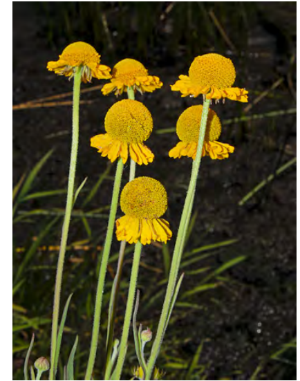
BIGELOW SNEEZEWEED ( Helenium bigelovii ) Native Perennial - Sunflower Family - (Jul-Aug) - Wet meadows, marshes, bogs, fens, streambanks, lake margins - Plant 1-4' tall. Flower head spherical, disk flowers 0.1-0.2" long; rays 0.5-1" long, pointing down.