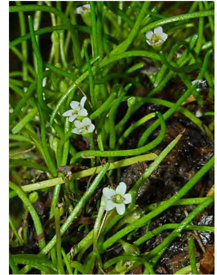
DELTA MUDWORT ( Limosella australis ) Naturalized Annual - Snapdragon Family - (Apr) - Muddy or sandy intertidal flats, brackish water - Leaf 0.4-1.2" long, awl-like, cylindric. Flower stalk < leaves. Flowers white, 0.12" long w/rounded lobes.