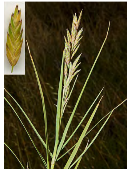
SALT GRASS ( Distichlis spicata ) Native Perennial - Grass Family - (Apr-Sep) - Salt marshes, coastal dunes, moist, alkaline areas - Stem 4-20" long. Leaves 0.8-4" long, flat, stiff. Flower cluster 0.8-3" long, narrow. Spikelets straw-colored to purple, 2-20/group, 0.24-0.8" long.