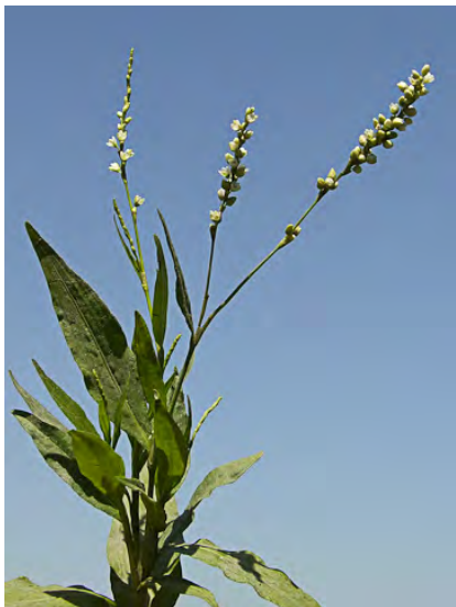
WATER SMARTWEED ( Persicaria punctata ) Native Annual-Perennial - Buckwheat Family - (Jun-Nov) - Shallow water, shores, marshes, floodplain forest - Flowers ~0.15" long, 5-lobed, white margins, gland-dotted. Fruit black, shiny.