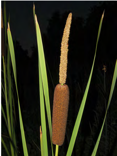
NARROW-LEAVED CATTAIL ( Typha angustifolia ) Native Perennial - Cattail Family - (May–Aug) - Nutrient-rich freshwater to brackish marshes, wet disturbed places - Plant 4.9-9.8' tall. Leaves gen < 0.4" wide. Flower cluster gap > 0.4".