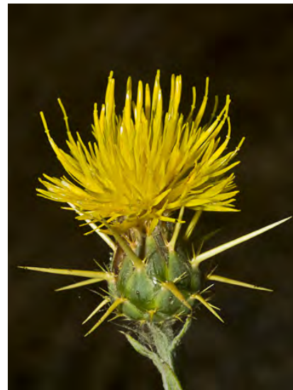
YELLOW STAR-THISTLE ( Centaurea solstitialis ) Naturalized Annual - Sunflower Family - (May-Oct) - Invasive, roadsides, disturbed grassland or woodland - Plant 4-39" tall. Leaves woolly, extend down the stem. Flower bract spines 0.4-1" long. NOXIOUS weed.