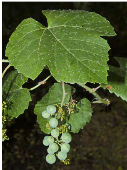
CALIFORNIA WILD GRAPE ( Vitis californica ) Native Perennial - Grape Family - (May-Jun) - Streambanks, springs, canyons - Woody vine to 33'+long. Leaves deciduous, heart-shaped to kidney-shaped. Fruit purple when mature, gen > 0.3" wide.