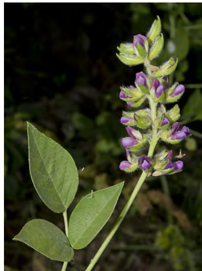
LEATHER ROOT ( Hoita macrostachya ) Native Perennial - Pea Family - (May-Aug) - Streamsides, marshes, spring-moist places - Stem erect, < 6.6' tall, much-branched. Leaflets 0.8-4" long, both sides sticky. Flowers ~0.4" long, blue to purple.