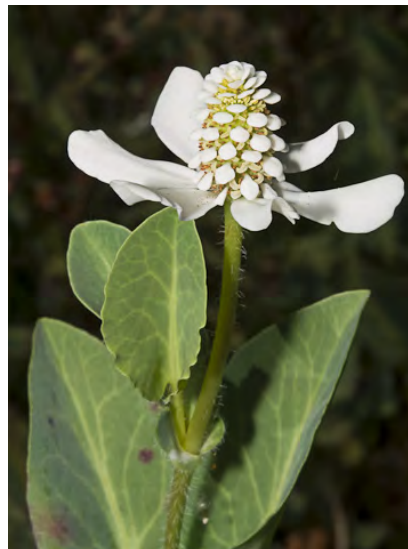
YERBA MANSA ( Anemopsis californica ) Native Perennial - Lizard's-tail Family - (Mar–Sep) - Common. Saline or alkaline soil, wet or moist areas, seeps, springs - Stems 3-32" long. 4-9 petal-like bracts 0.2-1.4" long, white often tinged red. Was used medicinally.