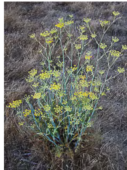
FENNEL ( Foeniculum vulgare ) Naturalized Perennial - Carrot Family - (May–Sep) - Roadsides, disturbed sites - Plants 3-6.5' tall, anise-scented. Stems waxy-blue, canelike. Flowers yellow. Leaf segments thread-like, edible when young. INVASIVE weed.