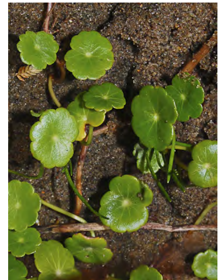
WHORLED MARSH PENNYWORT ( Hydrocotyle verticillata ) Native Perennial - Ginseng Family - (Apr–Sep) - Lake margins, ponds, slow-moving streams, canals, seeps, springs, marshes - Plant creeping. Leaf 0.4-1.6" wide, round, 8-13 shallow lobes.