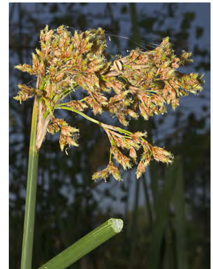
SOUTHERN BULRUSH ( Schoenoplectus californicus ) Native Perennial - Sedge Family - (Spring–summer) - Common. Brackish to fresh marshes, shores - Stem 3.3–13' tall, slender, bright green, bluntly 3-angled. Flower cluster somewhat open.