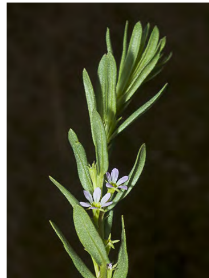
GRASS-POLY ( Lythrum hyssopifolia ) Naturalized Annual-Perennial - Loosestrife Family - (Apr-Oct) - Marshes, drying pond margins, disturbed ground - Stem 4-24". Leaves 0.2-1.2" long, ~ elliptical. Petals pink, 0.1-0.2" long. 2 awl-like appendages. INVASIVE weed.