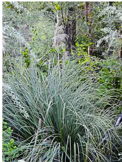
SMOOTH PAMPAS GRASS ( Cortaderia selloana ) Naturalized Perennial - Grass Family - (Sep-Mar) - Disturbed sites - Plant 6-13' tall. Leaf blades 0.1-0.5" wide, sheathes smooth. Cultivar, rarely escaped. INVASIVE weed.