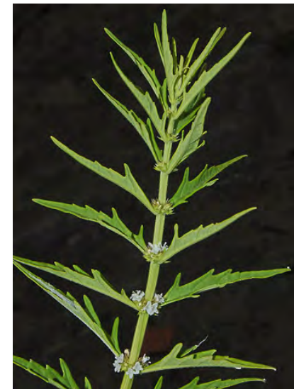
CUTLEAF BUGLEWEED ( Lycopus americanus ) Native Perennial - Mint Family - (Aug–Sep) - Moist areas, marshes, streambanks - Stem 8-32" tall, nodes short-hairy. Leaves 0.8-3" long, w/short stems, irregularly lobed and cut. Flowers white, ~0.1" long.