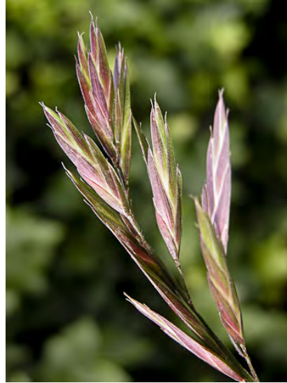
RESCUE GRASS ( Bromus catharticus var. catharticus ) Naturalized Annual-Perennial - Grass Family - (Apr-Nov) - Open, disturbed places - Plant 8-48" tall. Flower cluster 3-12" long, ~ open. Spikelet flattened, 0.6-1.2" long. Lemma 0.4-0.7" long, awn < 0.2" long.