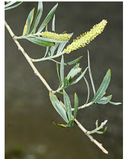
HINDS' WILLOW ( Salix exigua var. hindsiana ) Native Perennial - Willow Family - (Apr-May) - Common. Floodplains, sandy gravel - Shrub or tree < 17' tall. Leaf blades 1.2-6" long, linear, mature dense soft-hairy below. Ovary hairy.