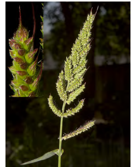
BARNYARD GRASS ( Echinochloa crus-galli ) Naturalized Annual - Grass Family - (Jun-Oct) - Gen wet, disturbed sites, fields, roadsides - Stem 12-39" long. Leaf blades to 25" long, 0.2-1.2" wide. Spikelet 0.1-0.16" long, floret ~0.14" long, 1 per node. Awns 0-2" long on same plant.