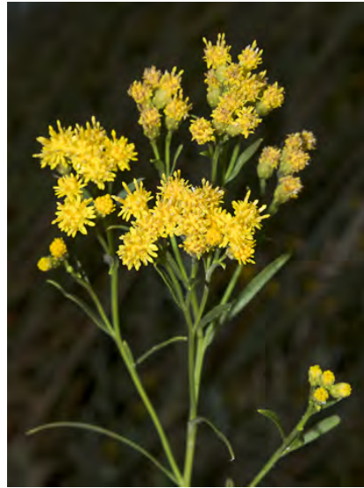
WESTERN GOLDENROD ( Euthamia occidentalis ) Native Perennial - Sunflower Family - (Jul-Nov) - Marshes, streambanks, meadows - Stem < 6.6', smooth. Leaves < 4" long, <= 0.24" wide, w/dark glandular pits. Flowers yellow, rays 0.06-0.1" long.