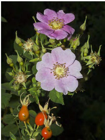
CALIFORNIA ROSE ( Rosa californica ) Native Perennial - Rose Family - (Feb–Nov) - Gen ± moist areas in sun, esp streambanks - Shrub 2.6-8.2' tall w/thick curved spines, forming thickets. Petals pink, 0.6-1" long; sepals unlobed.