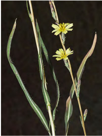
WILLOW LETTUCE ( Lactuca saligna ) Naturalized Annual - Sunflower Family - (Jul–Nov) - Roadsides, grassland - Stem 12-39" tall. Leaf lobes entire or few-toothed, no prickles underneath. Flowers 5-12, pale yellow, open in morning.