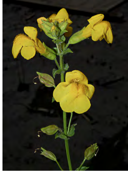
GOLDEN MONKEYFLOWER ( Mimulus guttatus ) Native Perennial - Lopsed Family - (Mar-Aug) - Common. Wet places, gen terrestrial, occ emergent or floating in mats - Plant 0.8-60". Flower yellow, gen > 0.8" long; mature bracts flattened sideways, inflated in fruit.