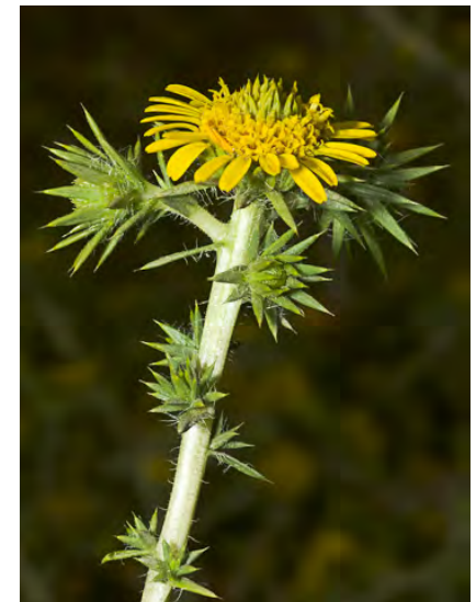
COMMON SPIKEWEED ( Centromadia pungens subsp. pungens ) Native Annual - Sunflower Family - (Apr-Nov) - Grassland, saltbush scrub, disturbed sites - Spiny. Leaves smooth or rough to the touch.