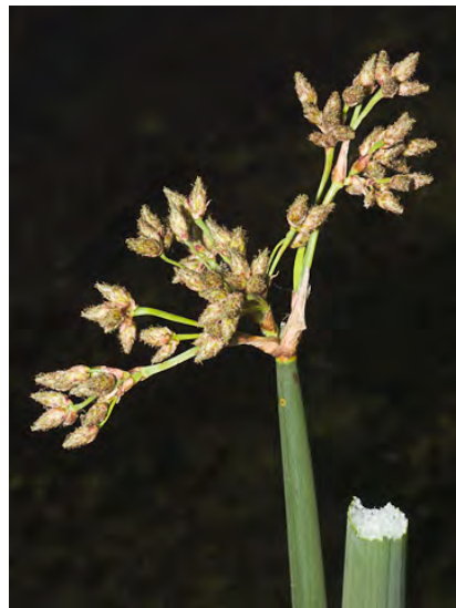
COMMON TULE ( Schoenoplectus acutus var. occidentalis ) Native Perennial - Sedge Family - (Summer) - Common. Marshes, shores, fens, shallow lakes, often emergent - Stem 3.3–13' tall, fat, round x-section, blue-green.