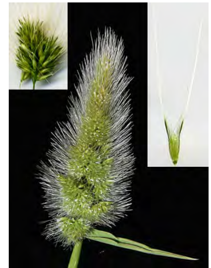
RABBITFOOT GRASS ( Polygomon monspeliensis ) Naturalized Annual - Grass Family - (Apr-Aug) - Moist places, along streams - Stem 8-39". Leaf 0.4-8" long, 0.16-0.24" wide. Flower cluster 0.4-6.7" long, plume-like. Glume awn > 0.14". Lemma awn gen < 0.1". INVASIVE.