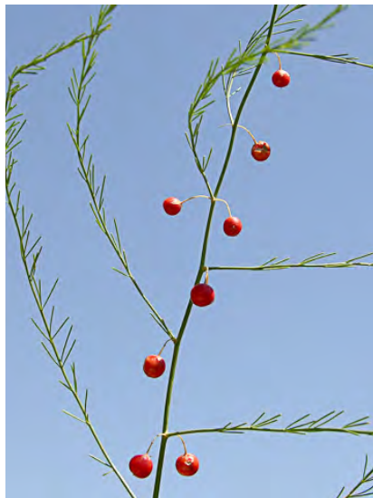
GARDEN ASPARAGUS ( Asparagus officinalis subsp. officinalis ) Naturalized Perennial - Lily Family - (Mar–Sep) - Disturbed places, roadsides, fields - Stem 3-10' tall. Flowers green-white, 3-7 mm long. Fruits red, ~0.3" long. Escaped garden vegetable.