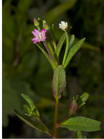
COMMON WILLOWHERB ( Epilobium ciliatum subsp. ciliatum ) Native Perennial - Evening Primrose Family - (Jun-Oct) - Common. Disturbed places, moist meadows, streambanks, roadsides - Plant 20-48" tall, smooth or short-hairy. Petals 2-6 mm, white to pink.