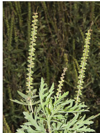
WESTERN RAGWEED ( Ambrosia psilostachya ) Native Perennial - Sunflower Family - (Jun–Nov) - Common. Roadsides, dry fields - Plant 1-6.5' tall, upright with long roots. Leaves 1-5" long with narrow lobes. Fruits spineless. Allergenic pollen.