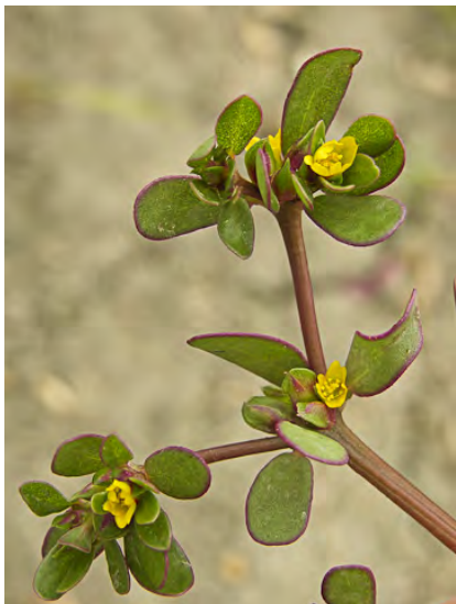
PURSLANE ( Portulaca oleracea ) Naturalized Perennial - Purslane Family - (Late spring-early fall) - Disturbed soil - Stem 1.2-16" long, spreading. Leaves 0.12-1.2" long, ~ spoon-shaped, flat. Flowers solitary. Petals yellow, 4-6, 0.12-0.2" long.