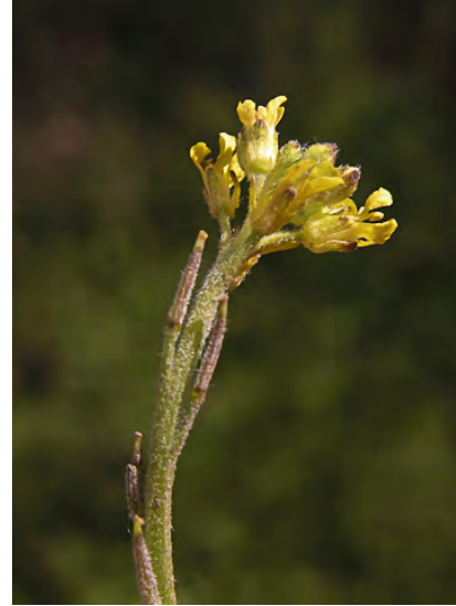
SHORTPOD MUSTARD ( Hirschfeldia incana ) Naturalized Biennial-Perennial - Mustard Family - (Apr-Oct) - Disturbed areas - Stem 16-60". Longest leaves 1.6-4" long, dense-hairy. Petals pale yellow, ~0.2" long. Fruit appressed. Fall-blooming. INVASIVE.